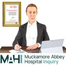
MAHI Muckamore Abbey Hospital Inquiry